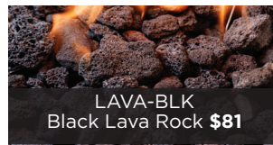
LAVA-BLK Black Lava Rock $81