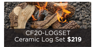
CF20-LOGSET Ceramic Log Set $219