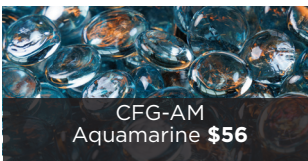
CFG-AM Aquamarine $56