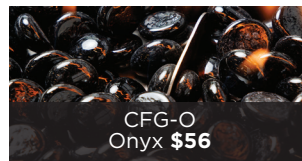
CFG-O Onyx $56