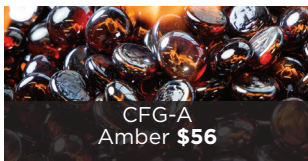
CFG-A Amber $56