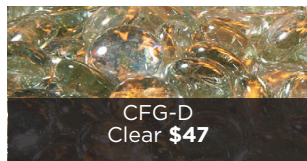
CFG-D Clear $47