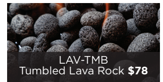
LAV-TMB Tumbled Lava Rock $78