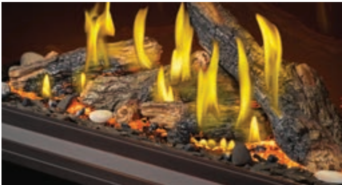
Oak logs with woodland kit