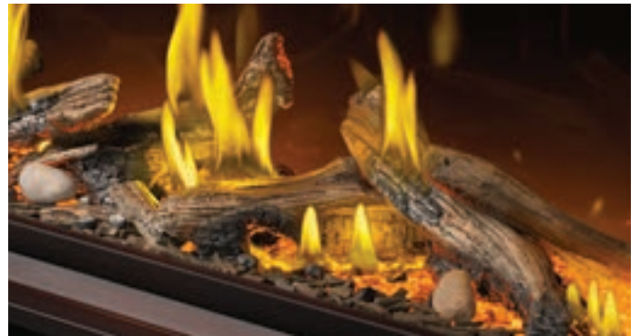
Driftwood logs with woodland kit