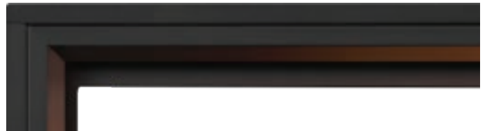
Adjustable finishing flange for modern frameless appearance