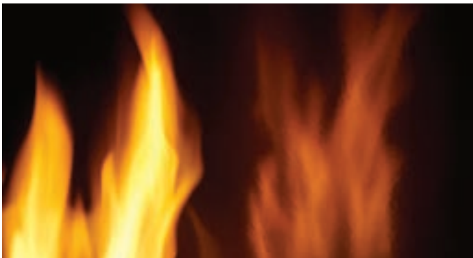
MIRRO-FLAME ® porcelain reflective radiant panels included