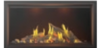
Tall Vector with Luminous Logs