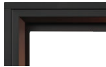
Adjustable finishing flange for modern frameless appearance.