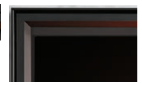
Adjustable 4pc 5/8" finishing trim for installations that require more coverage