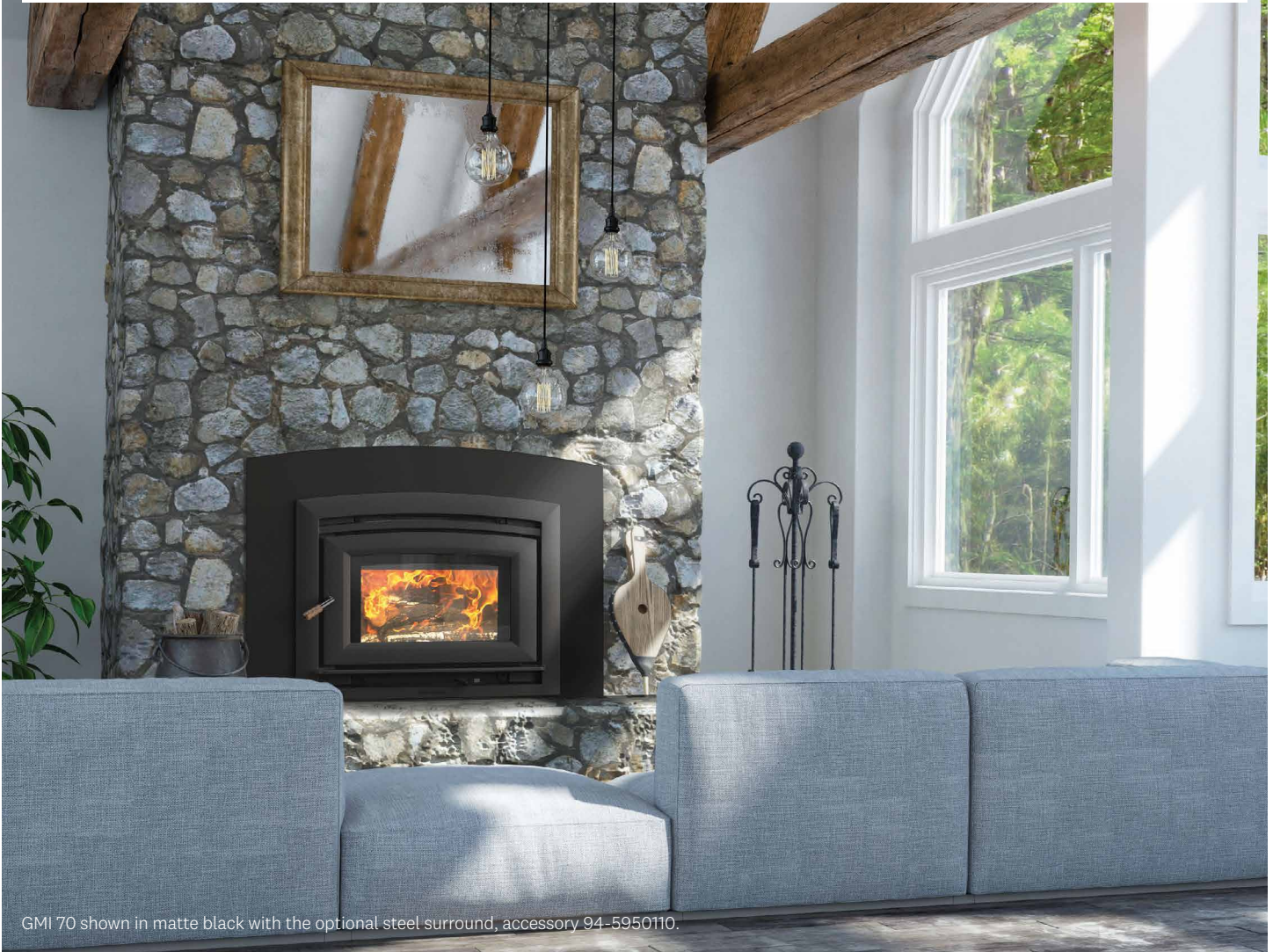
GMI 70 shown in matte black with the optional steel surround, accessory 94-5950110.